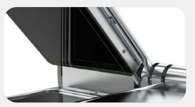
Steel frame with balanced top section