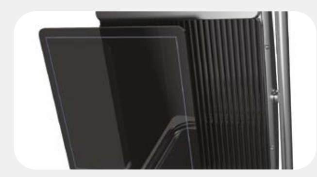
Smooth or ribbed glass ceramic surfaces