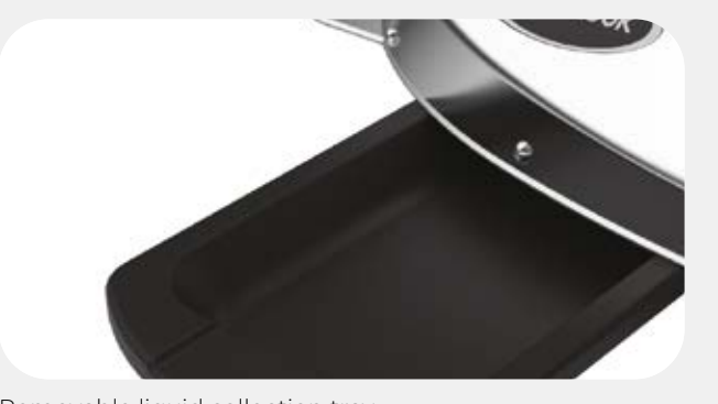
Removable liquid collection tray